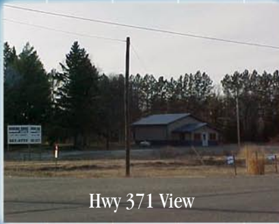
Hwy 371 View