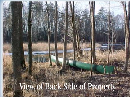
View of Back Side of Property